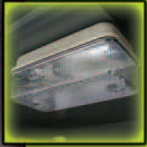
Interior Light (optional)